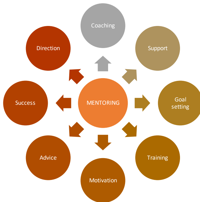
Figure 1. What is mentoring?